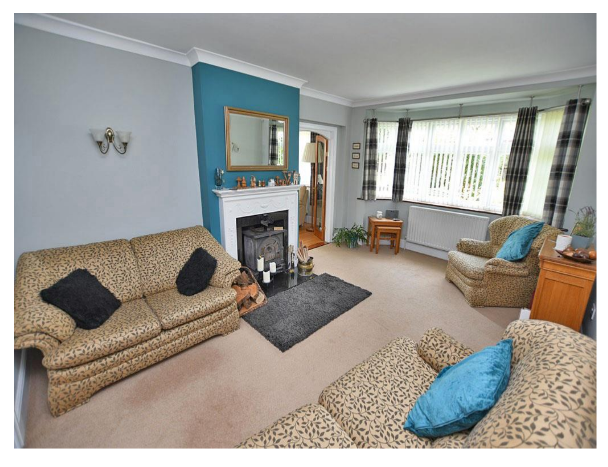
2 Byron Road Penenden Heath Maidstone ME14 2HA